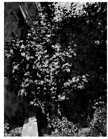
The above pictures of Bill Goertz's 'Kramer's Supreme', the one on the left taken-immediately after it was pruned in March 1965 and the one on the right after the season's full growth had taken place, show what occurs when a healthy camellia plant is pruned drastically.