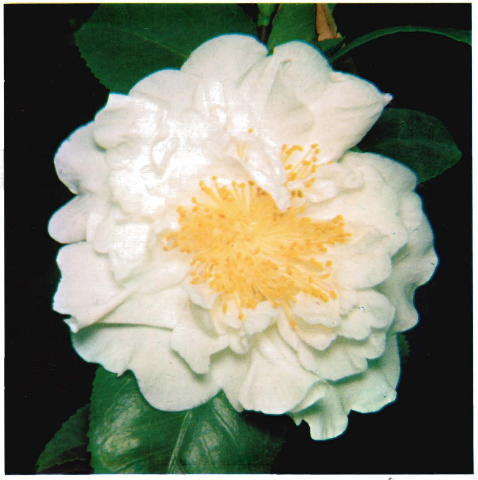
'Silver Ruffles'

A Publication of the Southern California Camellia Society